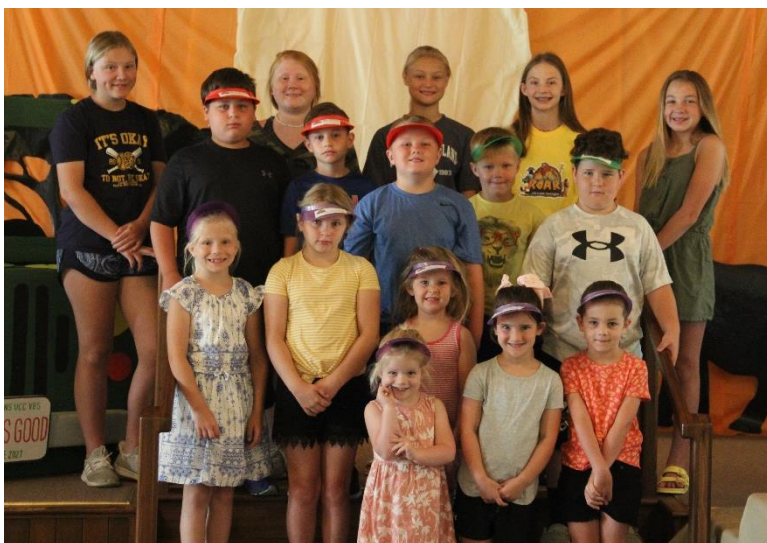
ROAR VBS Participants

Thursday, July 22: Newsletter articles due